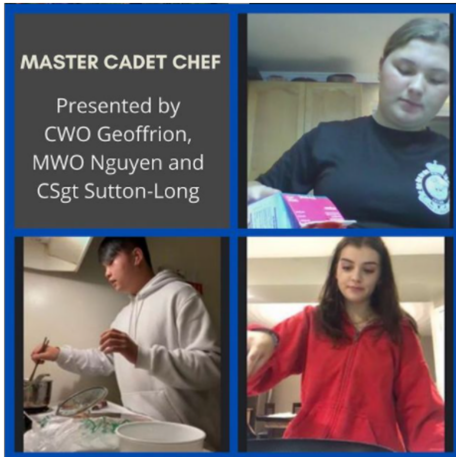
Senior Cadets teach a cooking class.