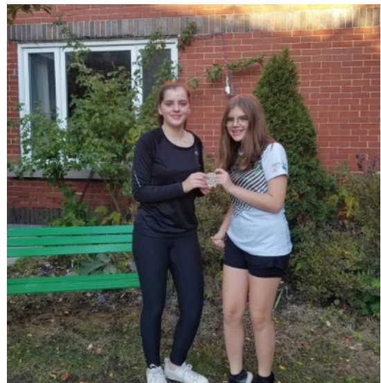
Virtual 5k run.